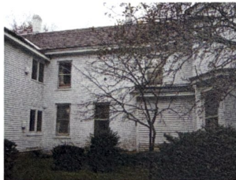
East Elevation at Addition, Conant Square