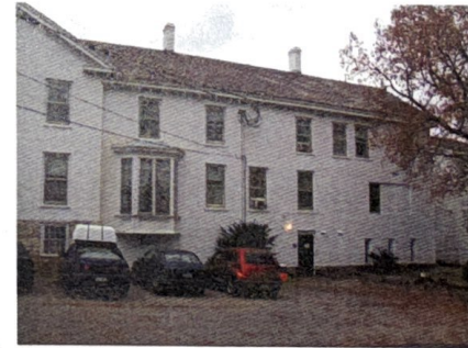
West Elevation, Conant Square