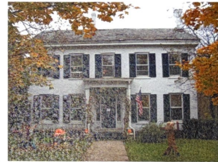
North Elevation, Conant Square