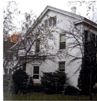
East Elevation, Conant Square