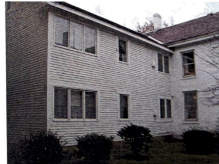
East Elevation at Addition, Conant Square