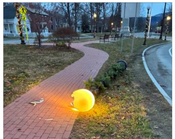
Lamppost #7 struck by motorist, 11/25 AM